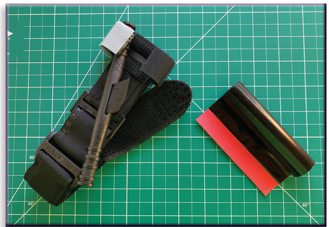
FIGURE 2 Emergency tourniquets tested.

LEFT: Combat Application Tourniquet Generation 7 (CAT), RIGHT: Solo-T (ST).