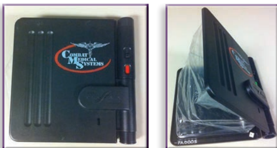
Figure 1 Prototype BVM by CMS.

When a simulated casualty required assisted ventilation, measurements were recorded in similar fashion to the first portion