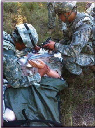
Figure 2 Assisted Ventilation With the Study Device in a Simulated Casualty.