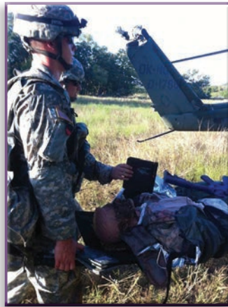
Figure 3 Assisted Ventilation With the Study Device During a Simulated Evacuation.

of the study. For these scenarios each Medic carried a standard device in their aid bag. The study devices were carried by the investigators and handed to the Medics as required. Medics assigned odd numbers used the study device first and those assigned even numbers used the standard device first. Total duration of assisted ventilation and number of breaths given were recorded for each device.