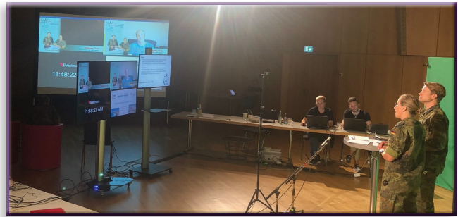
Setting of one of the session rooms at the virtual CMC conference.